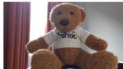
In Front of Light Source