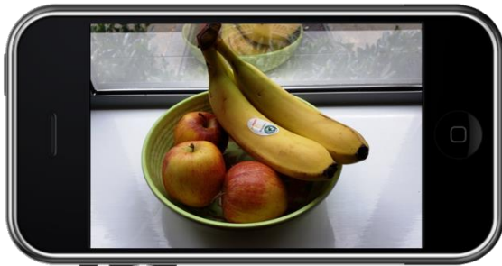
Horizontally-filmed image on widescreen