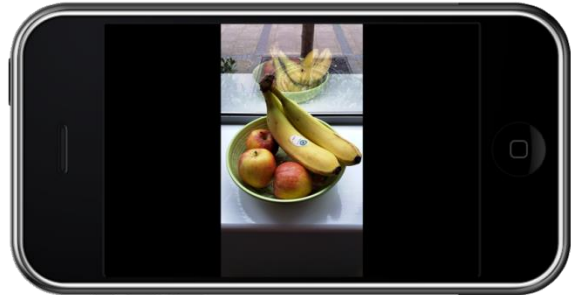
Vertically-filmed image on wide screen